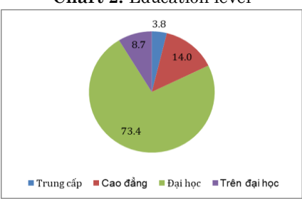
Chart 2: Education level

This statistical results of the intention to change work show that high qualified workers hold a high proportion, University accounted for 73.4%, college accounted for 14.0%, higher education accounted for 8.7%, middle level is the lowest rate accounted for 3.8%. It is also understandable because the highly qualified workers have higher physical and mental demands.